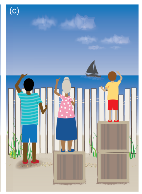
Current Conditions and Resources