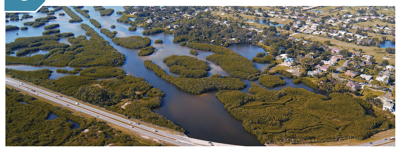
Key Message 1